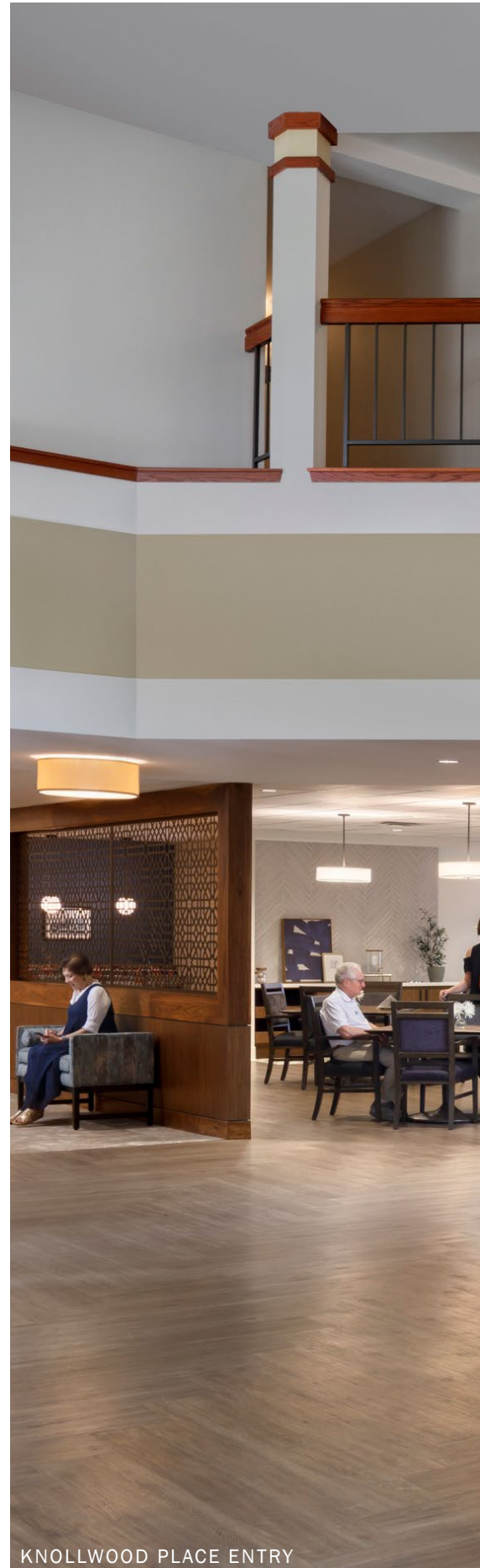
KNOLLWOOD PLACE ENTRY

Building on Sholom's mission of care, compassion and community, the goal for the project was to reimagine the interior design and program spaces in order to create a vibrant and marketable community for today and tomorrow's consumer expectations. The first step included an interior design master plan to set the overall direction for the entire continuum of care. One of the first phases of the master plan was Knollwood Place offering independent living and amenity spaces. The project scope was